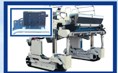
Fertilizer applicator unit