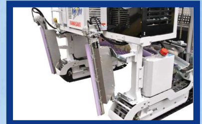
Hedge trimming unit

*Please note that changes may be made in specifications and product outer view without prior notice for the purpose product improvement.