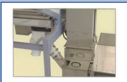
<Circulating system vertical bucket>

Instant high resolution, high performance CCD camera identification