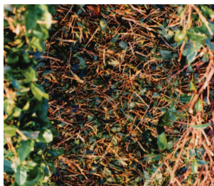
Dropping branches and leaves between ridges

Engine: Yanmer 4-cylinder diesel Displacement: 3318cc Rated power: 51.1kW/2500min -1 (69.5PS/2500rpm) Length (when operating): 2375mm Width (when operating): 2225mm Height (when operating): 2315mm Wheelbase: 1700mm, 1750mm, 1800mm, 1850mm Maximum climbing degree: 150 Driving speed: 0 to 3.7km/h Valid trimming height: 500 to 700mm, 500 to 800mm Performance: 60min/10a (Varies depending on operating environment) Trimming blade: Reciprocating hedge cutter