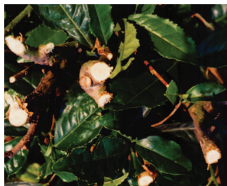
No damage on trunks and branches